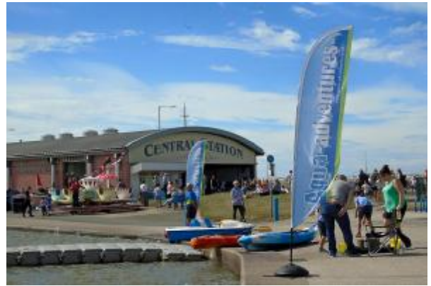
Teddy Bear's Picnic: Boat rides and funfair rides Clara holidays, again