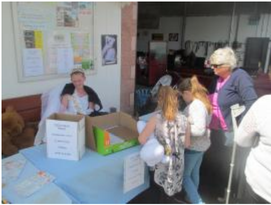
Teddy Bear's Picnic: Competitions From the Archives