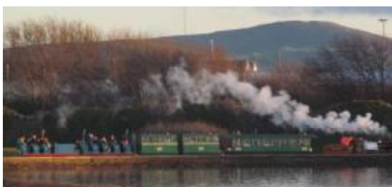
New Treatment plant for locomotive water

With the Christmas receipts being particularly good, the railway was left with a financial surplus which the Trustees decided to invest in a new plant to treat the water for our steam locomotives. We bought the plant from a local supplier and plumbed it into place ourselves – the new holding tanks we placed as high as we could inside 'Central Station'.