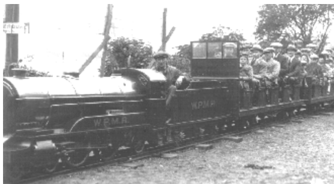
When new, at the Woodland Park Miniature Railway in Kent (named Michael). No images of RQ at its next location have yet come to light – The Saracens Head public house in Cheshire