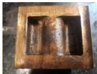
Inside the left hand side valve chest of Railway Queen, with the heavily worn right hand side valve above

Railway Queen passed its boiler inspection on 14th June and this has enabled the boiler insulation, cladding and cab to be fitted so that the loco is now complete except for a few finishing touches.