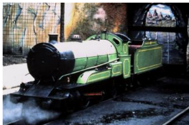
At Belle Vue wearing the very light green livery on which the current restoration is based (Edward Dorricott, July 1973).