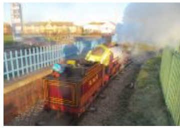
RMR loco Michael was sufficiently complete to be steamed on 14 th December following its overhaul

Santa Trains 2022: Last year's Santa trains once again broke all records with 867 children visiting Santa. This number was helped by two extra group bookings. We ran 9 days of public trains and all trains were fully booked with this being first public use of the new coach 9 and it was loved by all who travelled in it.